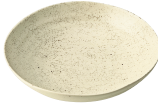
Shirokairagi Rokubei 68 deep plate φ21×5.2cm