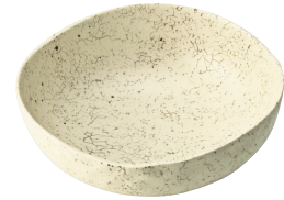
Shirokairagi Triangular 55 bowl φ16.7×6.1cm

Triangular 35 bowl / Triangular 80 plate / Rokubei 55 shallow bowl