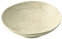
Shirokairagi Rokubei 55 shallow bowl φ17×4.9cm