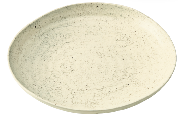
Shirokairagi Triangular 80 plate φ22.7×4.5cm