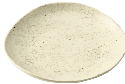
Shirokairagi Triangular 50 plate φ16.5×3.2cm