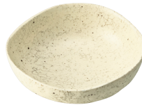
Shirokairagi Triangular 45 bowl φ13.7×5cm