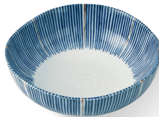
Some Tokusa Triangular 55 bowl φ16.7×6.1cm