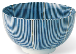
Some Tokusa Okonomi bowl S φ13.2×7.4cm