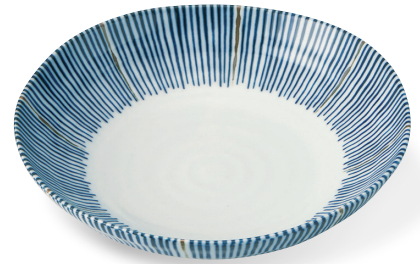
Some Tokusa Rokubei 68 deep plate φ21×5.2cm