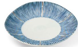
Some Tokusa Triangular 40 plate φ13.6×2.8cm