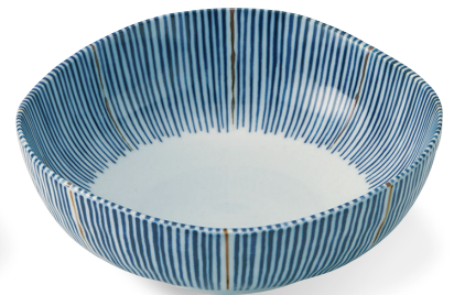
Some Tokusa Triangular 68 bowl φ20.5×7.4cm