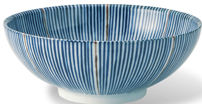
Some Tokusa Noodle bowl φ21.4×8.2cm