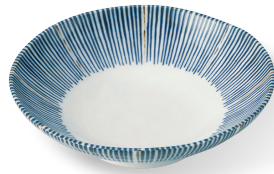
Some Tokusa Rokubei 55 shallow bowl φ17×4.9cm