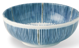
Some Tokusa Storage 45 B φ13.2×5.3cm