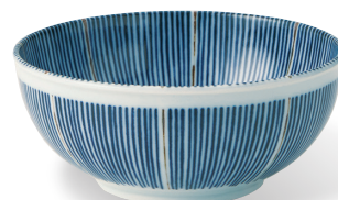
Some Tokusa Storage 50 B φ16×6.8cm