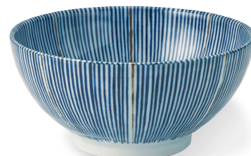
Some Tokusa Sanuki bowl φ18.5×9cm