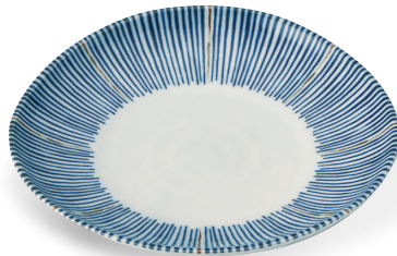
Some Tokusa Triangular 60 plate φ19×3.7cm