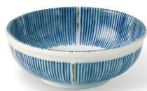
Some Tokusa Storage 35 B φ10.7×4cm

"Tokusa Pattern" is a standard pattern for Japanese vessels. Simple as it looks, stripe pattern with two colors, indigo color and rust color, project a stylish and Japanese stylish coordination.