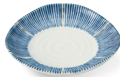
Some Tokusa Triangular 35 plate φ12.1×2.5cm