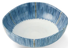
Some Tokusa Triangular 45 bowl φ13.7×5cm