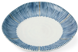
Some Tokusa Triangular 50 plate φ16.5×3.2cm